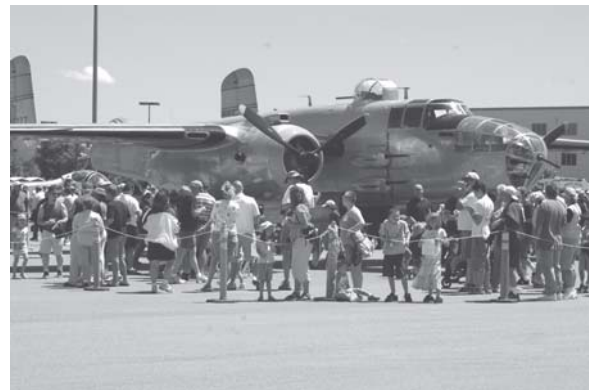
B-25 Martha Jean