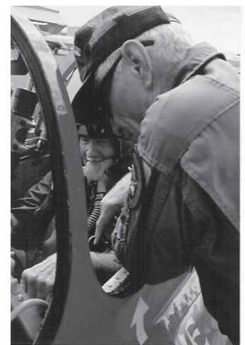
(Others who have "Flown West" can be found on page 5.)